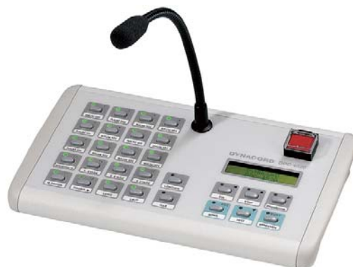
Abb.: DPC4520 paging station

Line monitoring for the audio cabling as well as for RS 485 control lines provide early recognition and signalling of line interrupts and short circuits. The configuration of the paging consoles are accomplished via PROMATRIX® Designer software. All paging consoles have CE approval as well as UL and CSA recognition and are EN 60849 / VDE 0828 conformable in combination with the PROMATRIX® system.